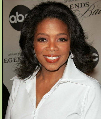
Oprah Winfrey-chat show hostess