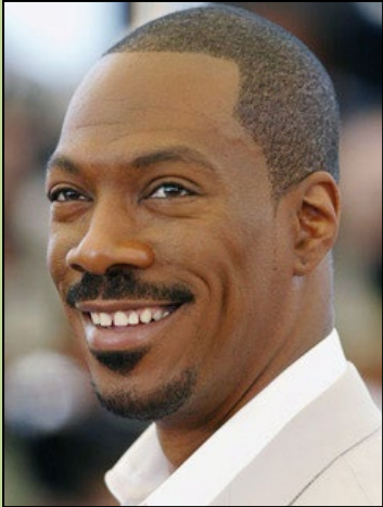
Eddie Murphy-actor and comedian

ምስ መዕበይቲ ስድራቤታት ዝነብሩ ዝነበሩ ፍሉጣት ሰባት እውን ብተሓት እዮም፣ ንኣብነት፤